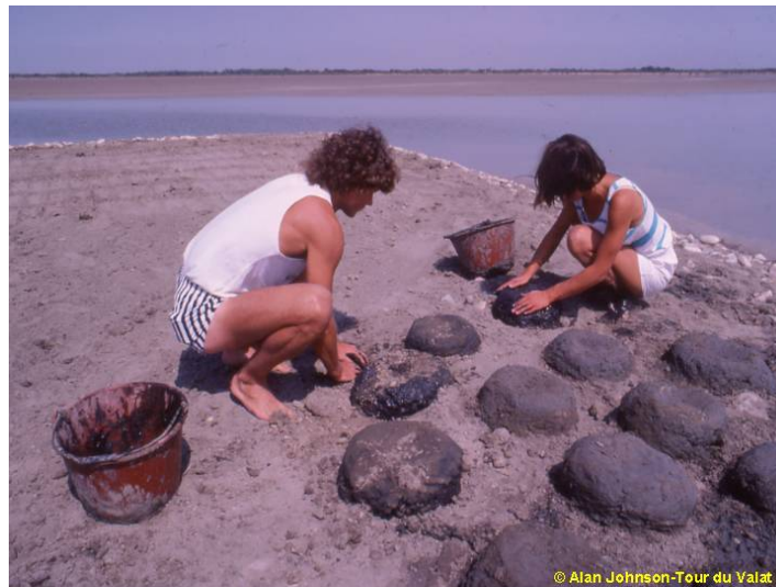
Figures 2 and 3. Creation of artificial nests on the flamingo breeding island of the Fangassier in the Camargue, France